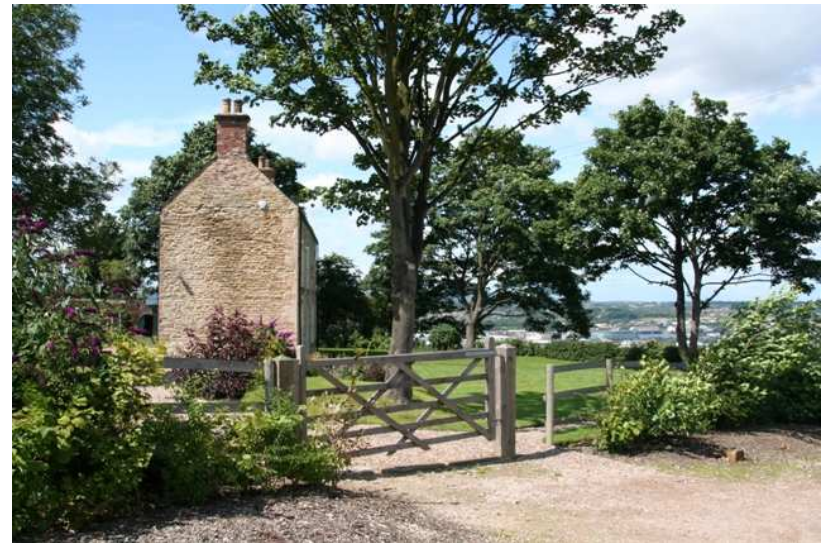
Farmhouse at Manor Oaks

All individual ceramicists have a work bench and storage facility. The workshop is equipped with:-