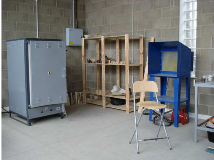
Inside the Starter Studio