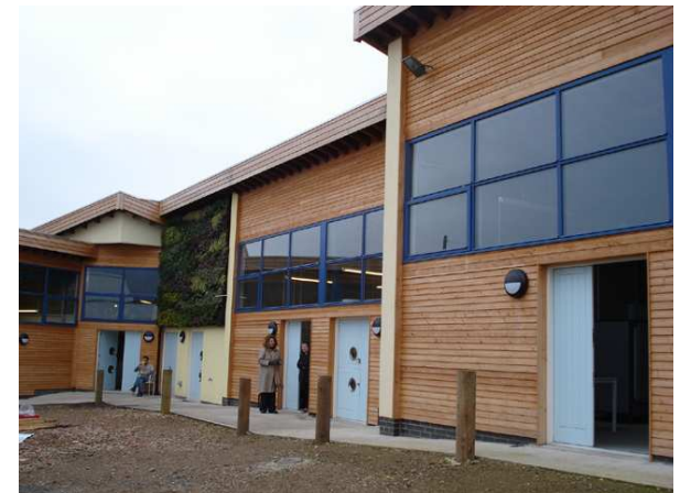
Manor Oaks Studios