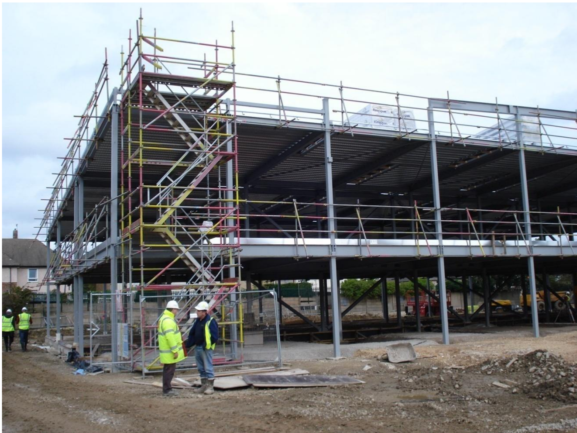
Knutton Road Studios, Parson Cross, October 2010

Under construction and planned for completion summer 2011 (see Development above).