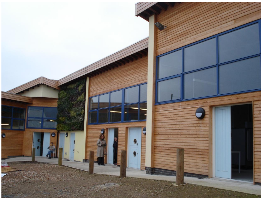
Manor Oaks Studios with Living Wall, February 2011