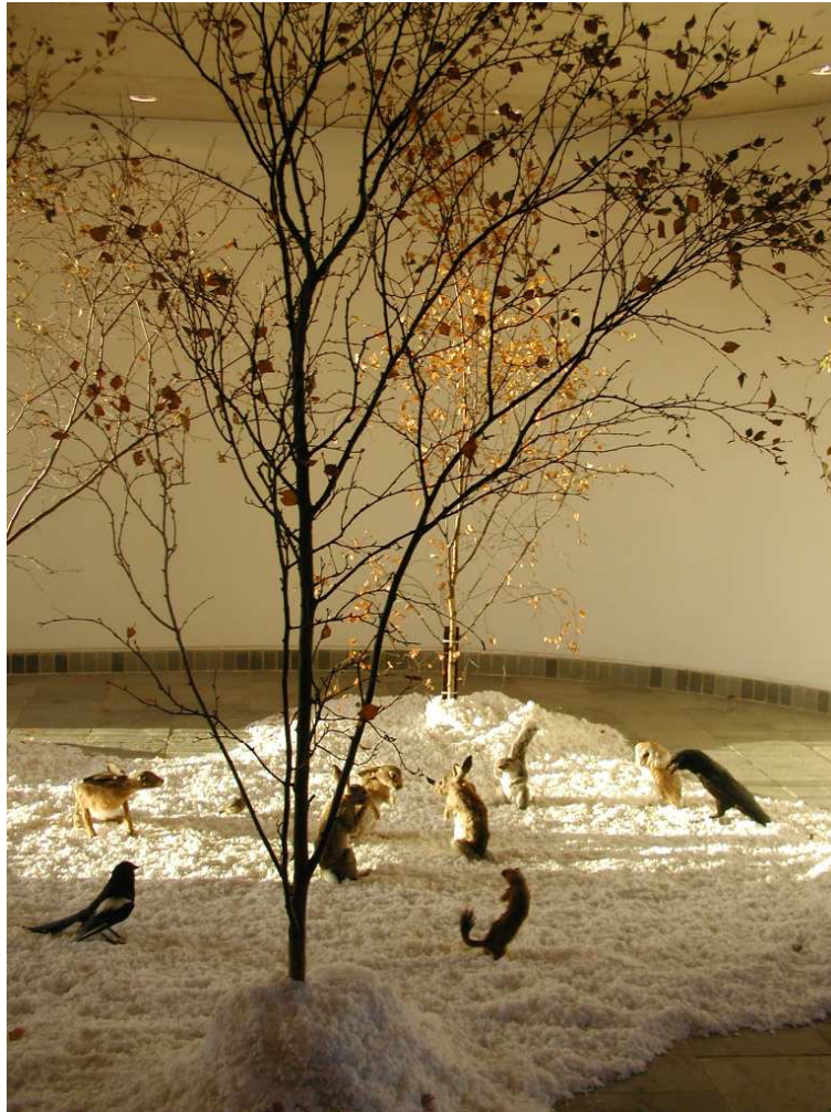
'Winter Wonderland' Chloe Brown