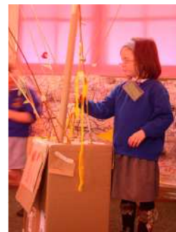
Left to right images from projects at; The Kingstone School, Herringthorpe Primary School, Rossington All Saints College and Brampton Cortonwood Infants School respectively