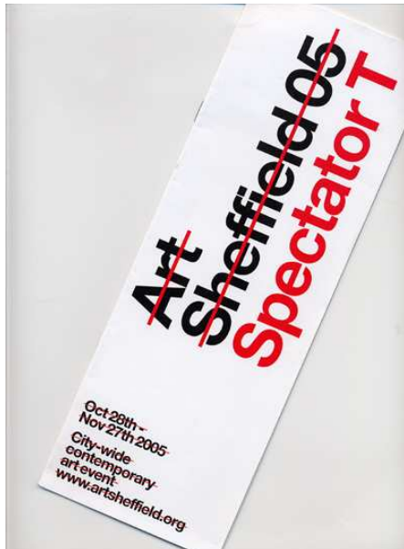
front cover publicity brochure