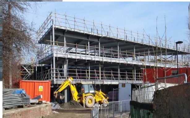
Images: Knutton Road Studios, building work in progress. Scheduled for completion by autumn 2011