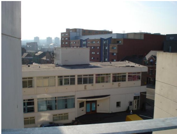
Porter Brook Studios from Persistence Works, Sheffield

Porter Brook Studios opened in July 2009 offering 16 new studio spaces to artists for a minimum of two years. Part of the AVEC building owned by Sheffield City Council, the short-term lease was negotiated while the larger site awaits redevelopment allowing us to build up a pool of artists that may be interested in relocating to the longer term studio developments. New financial systems enabled existing staff to manage the additional studios with no increase in hours.